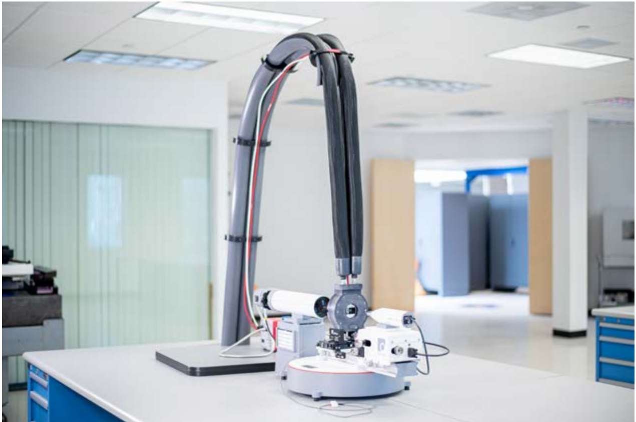
LensCheck VIS with Thermal Chamber and Sky Hook (Temperature Controller and Manifold not shown)