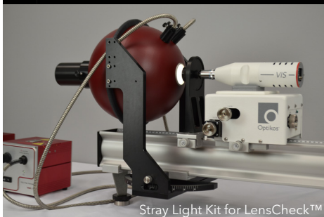
Stray Light Kit for LensCheck™