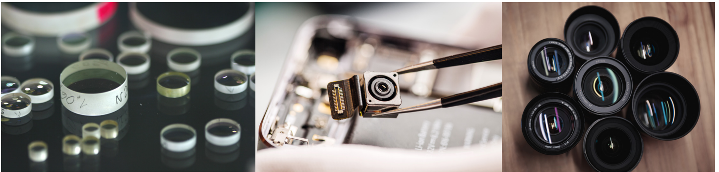
Image quality testing is offered for lenses, cameras, optical and electro-optical components and systems that operate within the visible through the long wave infrared (LWIR) spectral range. Our lab houses a complete collection of Optikos metrology equipment - including OpTest®, LensCheck™ and Meridian® test benches and accessories - that can handle a wide range of object distances, and test both focal and afocal assemblies.